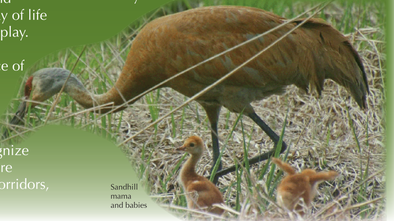
Sandhill mama and babies