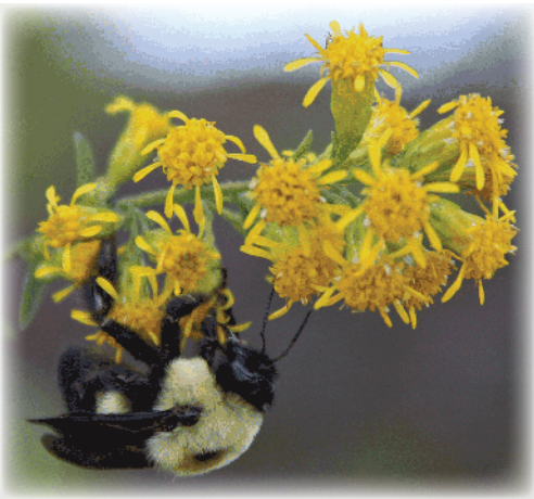
Bumblebee on goldenrod

This mission recognizes that the biological life of the township does not recognize property lines. Many of our native species will thrive if landowners agree to cooperate in land management practices.