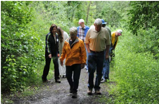
On a trail at Natureland